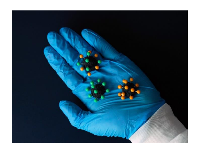
"Coronavirus Close Up Image"

The 6th edition of IEEE SMARTCOMP was re-scheduled also from June to start on September 14, 2020. As of the time of this writing, it is planned to be held in presence in Bologna, Italy.